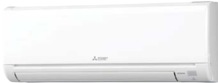
Indoor Unit: MSZ-GL06NA-U1